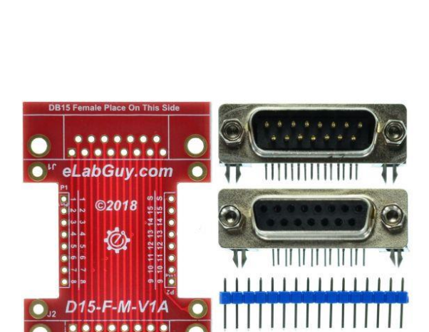
Figure 1: Parts inside the kit (Note: the module is not assembled, user can decide which connector to use on the module.)