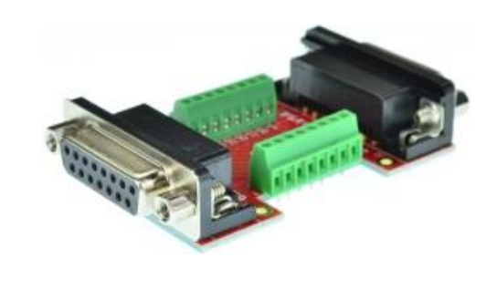
Figure 3: D15-F-M-V1A with headers